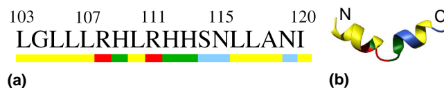
Figure 1. (a) Amino acid sequence and (b) structural model for B18 in a water/TFE 70:30 (volume fractions) mixture based on NMR data 2 in ribbon representation. The color code distinguishes between hydrophobic ( yellow ) and hydrophilic ( blue, green, and red ) residues.